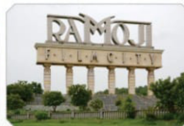
Ramoji Film City